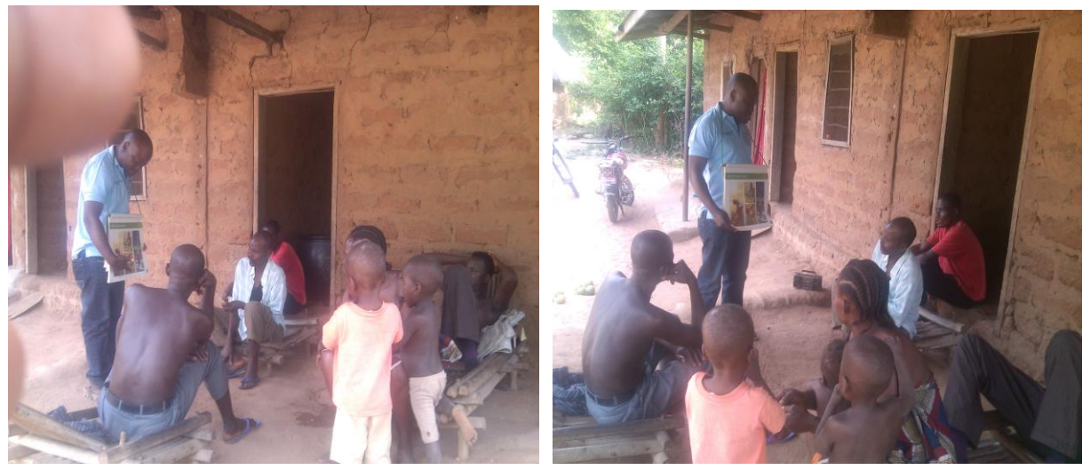
Fig. 7: IPC Conductor facilitating House to House session in M-mbam community