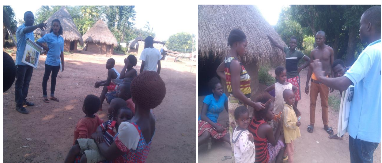
Fig. 8: IPC Conductor facilitating House to House session in Tse – Unande community