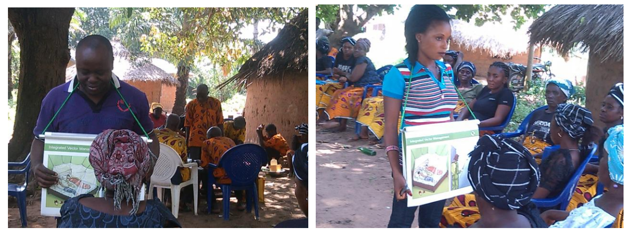
Fig. 10: IPC Conductors facilitating Group IPC session with women group in Tse - Aboga community