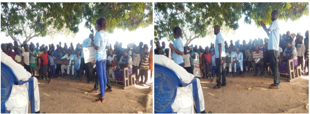
Fig. 4: IPC team interacting with community members during Community Dialogue in Mase