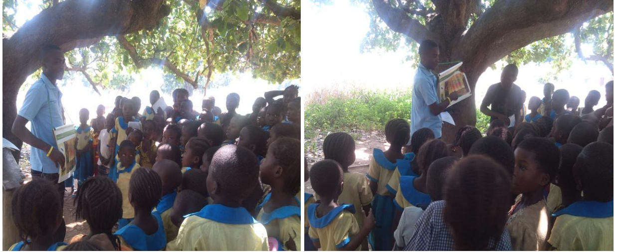
Fig. 6: IPC Conductor facilitating School based IPC in Assemblies of God Nur/Pri. Sch. Ahumbe